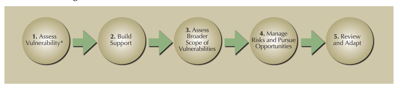
FIGURE 2: Management Framework

*Initial vulnerability assessments can focus on specific impacts or regions.